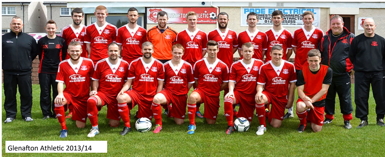
Glenafton Athletic 2013/14