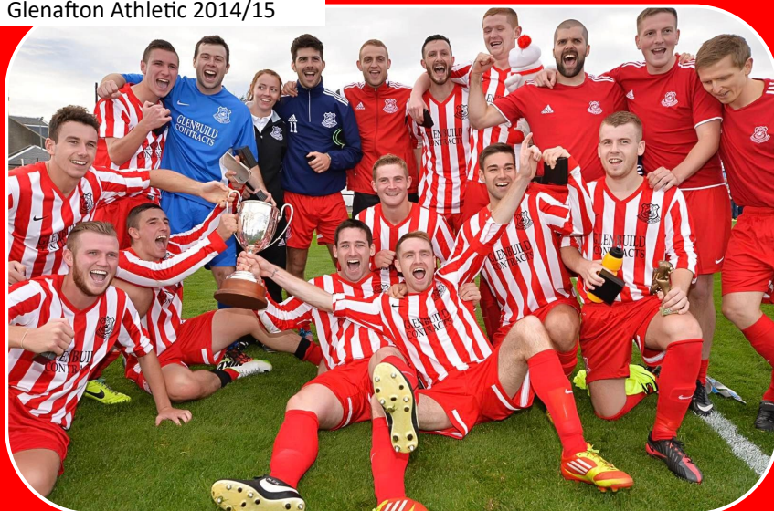
Glenafton Athletic 2014/15