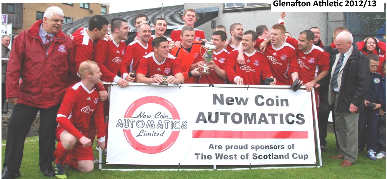
Glenafton Athletic 2012/13