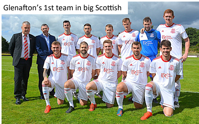
Glenafton's 1st team in big Scottish