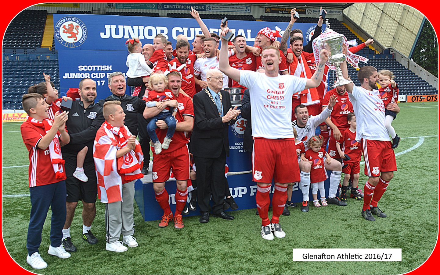
Glenafton Athletic 2016/17