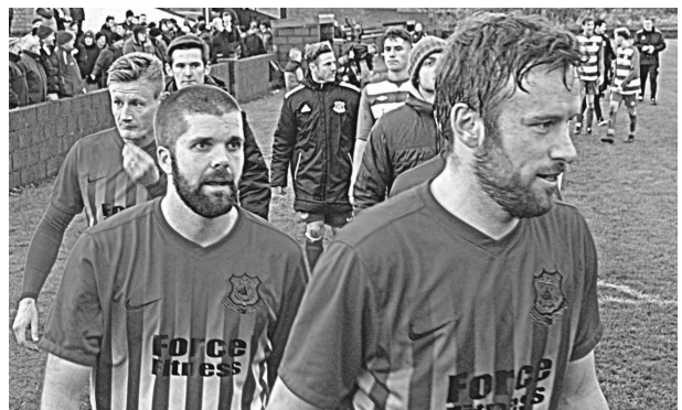
Three more points !